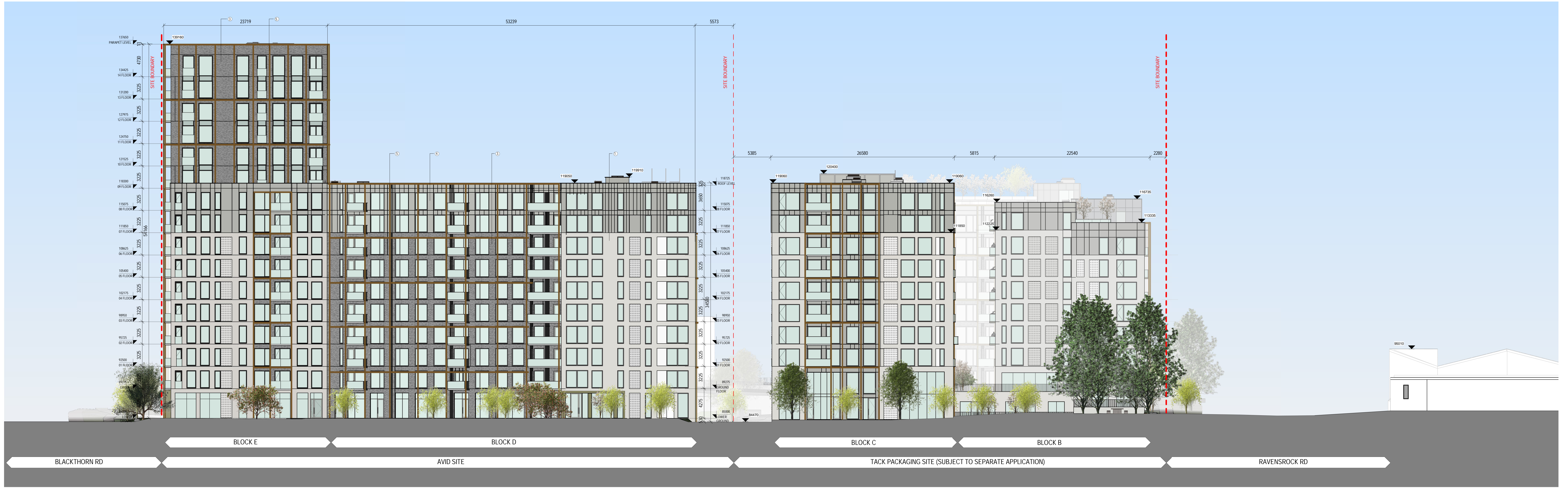
1 PROPOSED MASTERPLAN NORTH EAST CONTEXTUAL ELEVATION Scale: 1:200